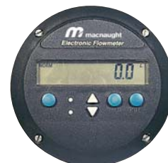
Deluxe LC Display