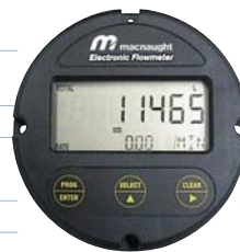
Standard LC Display